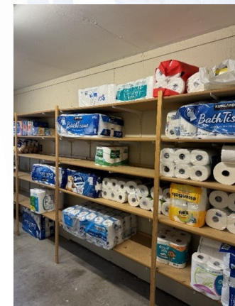
Pictured above: NAOMI’s pantry last month. Pictured below: NAOMI’s pantry this month. Let’s help them restock with needed supplies!

been a valued partner with NAOMI for over 8 years. They not only support us financially and with paper product drives, but they graciously provide meeting space and volunteers to cook dinners for our group learning nights. They also volunteer with childcare services so our mothers can focus on their healing journey. We are grateful for their grace and generosity in serving NAOMI’s mission!